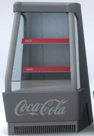
EASYREACH & EASYREACH WITH DOOR